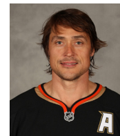
TEEMU SELANNE (NHL HALL OF FAME)